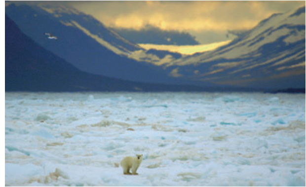
Polar bear and seagull.

Canada has still not met its obligations as an IUCN member. The "Red List instrument" in Canada is the Committee on the Status of Endangered Wildlife in Canada (COSEWIC). Thirteen of the 19 globally recog-