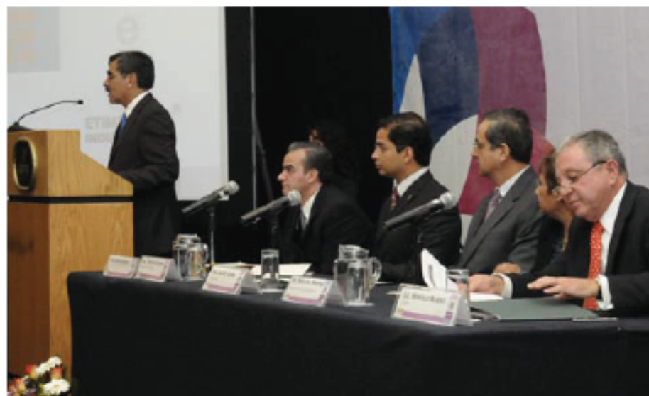
Juan Elvira Quesada, secretario de Medio Ambiente y Recursos Naturales presidió la entrega de reconocimientos "Liderazgo Ambiental para la Competitividad" acompañado por otros funcionarios y empresarios destacados.

La SEMARNAT reconoció en días recientes la gran labor que el Grupo ha desempeñado en favor de los recursos naturales de México